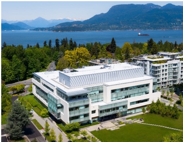
Allard Hall, University of British Columbia 1822 East Mall, Vancouver